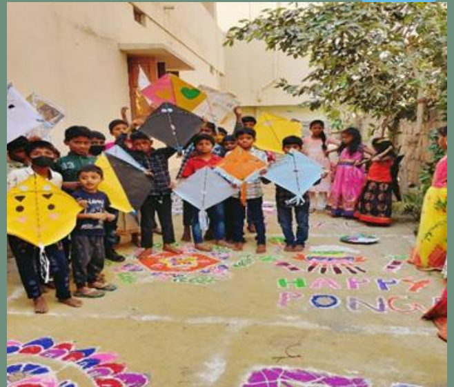
Pongal celebrations: Rangoli and kite making

As a public charitable trust registered in 2009, we have a section 12A exemption from the income tax department, an 80G certification for donors to claim tax exemption on their donations and a FCRA registration that enables us to receive funds from abroad.