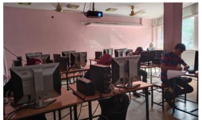
New Kriti Kaushal Center Located outside Lead Grammar school