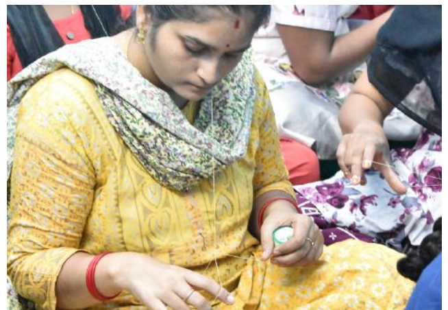
Women practicing threading at Bhoiguda