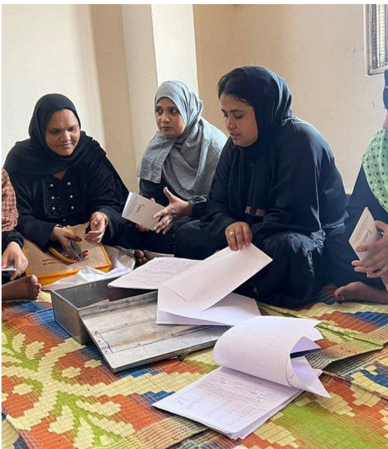
SHG meeting for Bismillah Mahila Pehchaan Group

Our aim is to provide self reliance and financial security to women who are home based workers, but who are unfortunately being exploited.