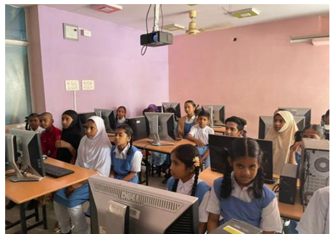
Lead Grammar school kids at Kaushal Center

Enabling free computer literacy skills for the underprivileged to give them access to the information highway by imparting knowledge of fundamental computer skills and Job readiness skills training.