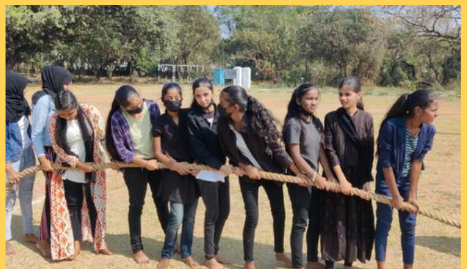
Field trip to army camp for 10th grade students