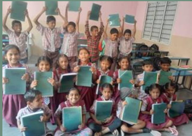
Workbooks distributed to all batches