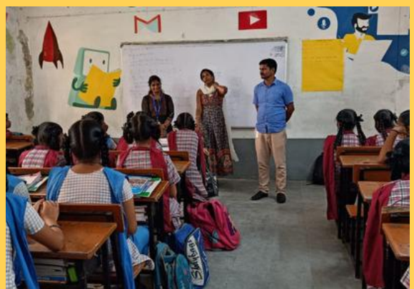
Mentoring program by Volunteers from Microsoft at Shaikpet High School