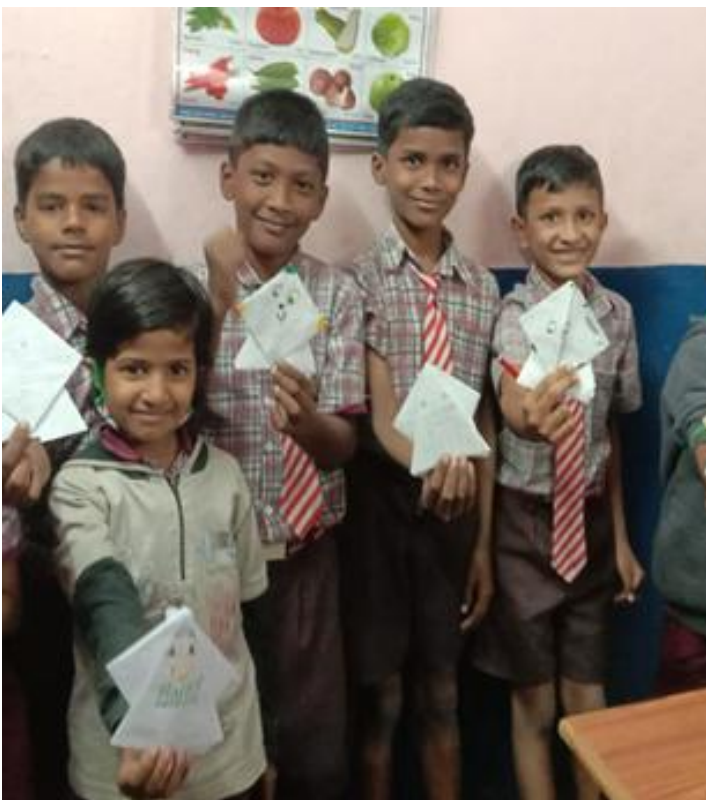
Art and craft activity by students