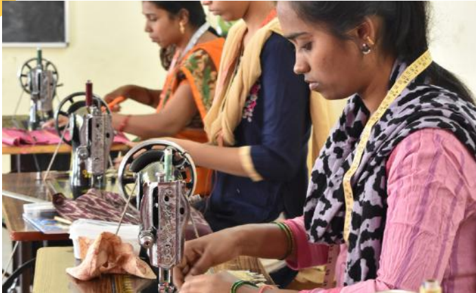
Tailoring Training Center

Project Milan is a program to provide vocational training for women close to their homes. Under the project, Kriti trains women in tailoring, embroidery and beautician training.