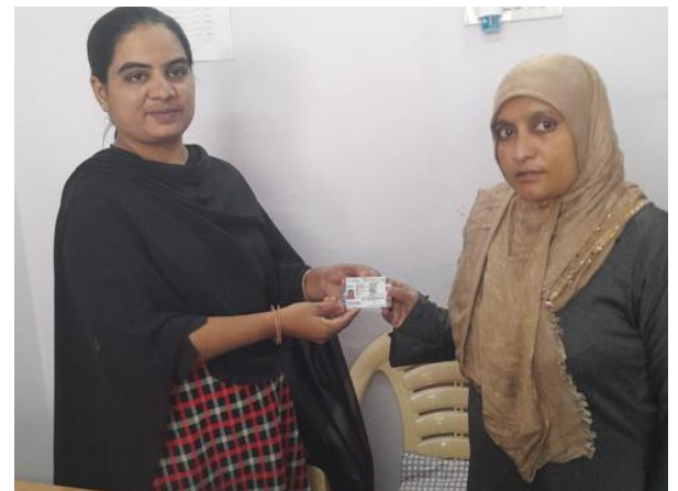
Lac bangle worker receiving her artisan ID card