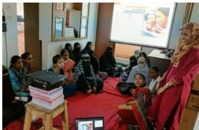
Career planning for girl students who passed 10th grade

The program focuses on ensuring basic education for all students and reducing school dropouts due to their families' financial difficulties.