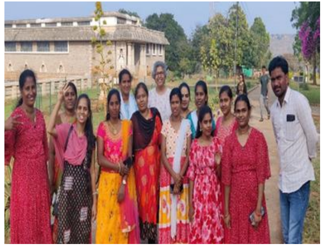
Teachers trip to Nagarjuna Sagar