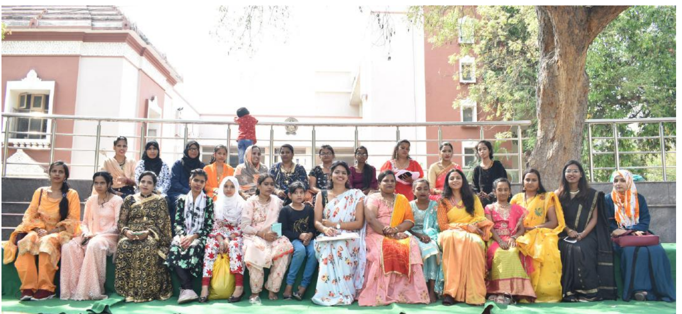
Hair styling contest participants at the Womens Day celebrations in March 2023