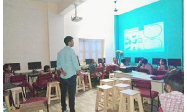
Computer Lab at NBT Government HGigh School

The aim is to enable computer literacy as part of a school curriculum for government high school children so that they gain valuable computer skills as part of their basic education.