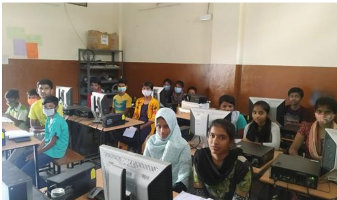
Computer basics class in progress