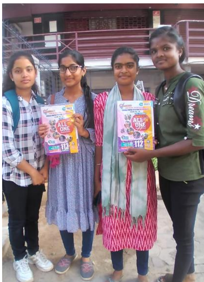
10th-grade student receive All-in-One books that contain previous year's exam papers