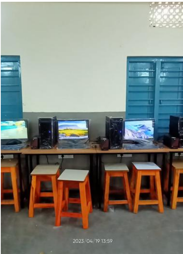
Computer lab at Shaikpet high school