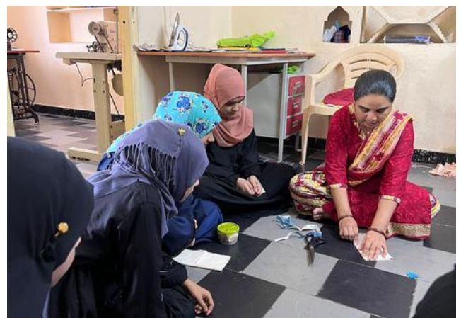
Women learning drafting at the Talabkatta training center