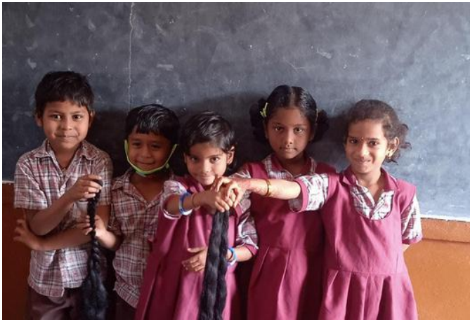
Classroom activity by Buniyaad student

Project Buniyaad was launched in response to the significant impact of the Covid-19 pandemic on primary education. Our emphasis was on strengthening the students' writing, reading, and speaking skills and enabling them to regain their appropriate grade level knowledge.