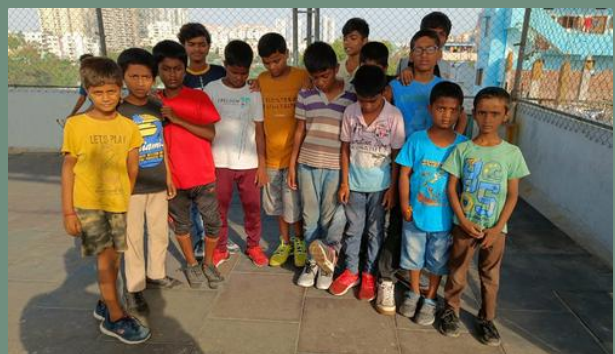
Shoe distribution to children