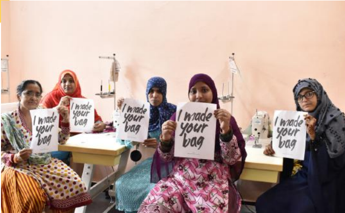
Hakimpet Kunta production unit