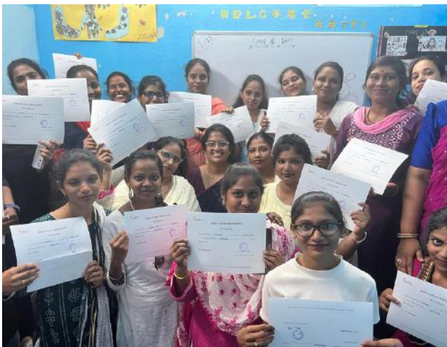
Certificate distribution at Bhoiguda beautician training center

TOTAL NUMBER OF CENTERS TAILORING 4 BEAUTICIAN 3