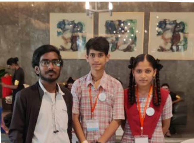
Students displaying their robotics projects at the Soham Annual Robotics Exhibition